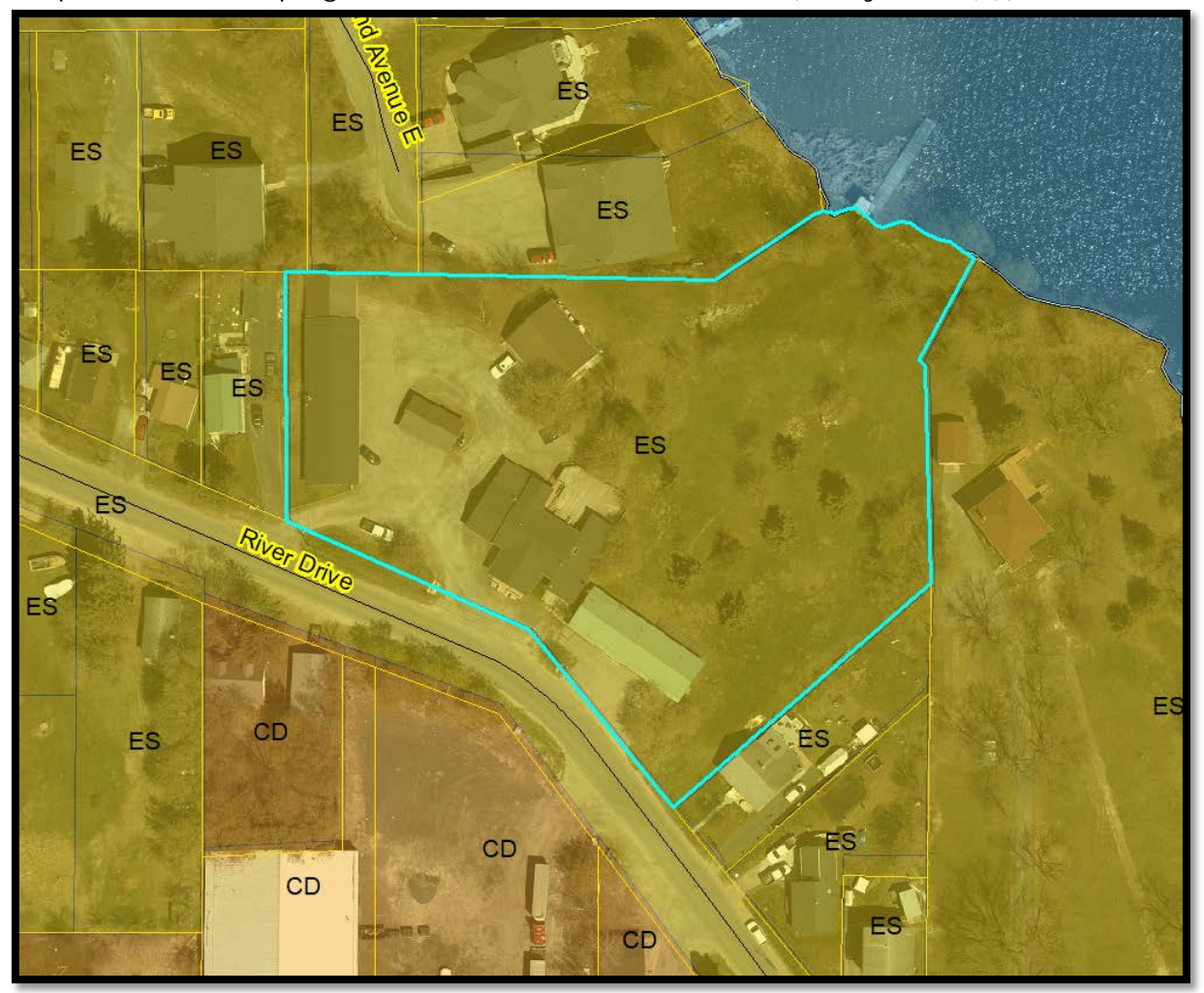
Figure 3 – Official Plan Mapping

Residential development is encouraged in the Established Area through plans of subdivision, condominium, and consent as infilling or redevelopment of existing uses on full municipal services. Medium density residential uses are supported provided that the development is in keeping with the character of the area (Policy 4.1.2(c)).