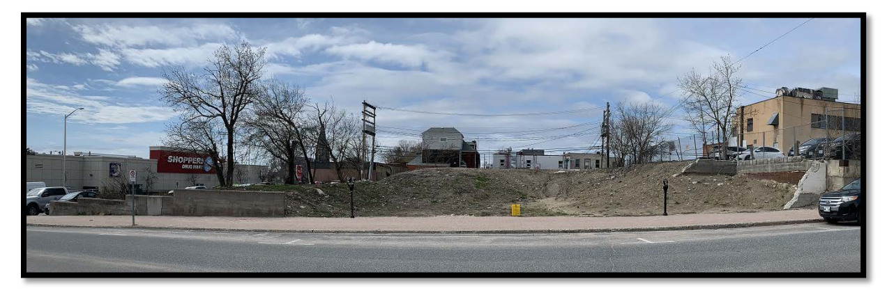
Figure 2 – Photo of the property from Matheson Street South.

On May 12, 2022, I conducted a site visit and took the following photo.