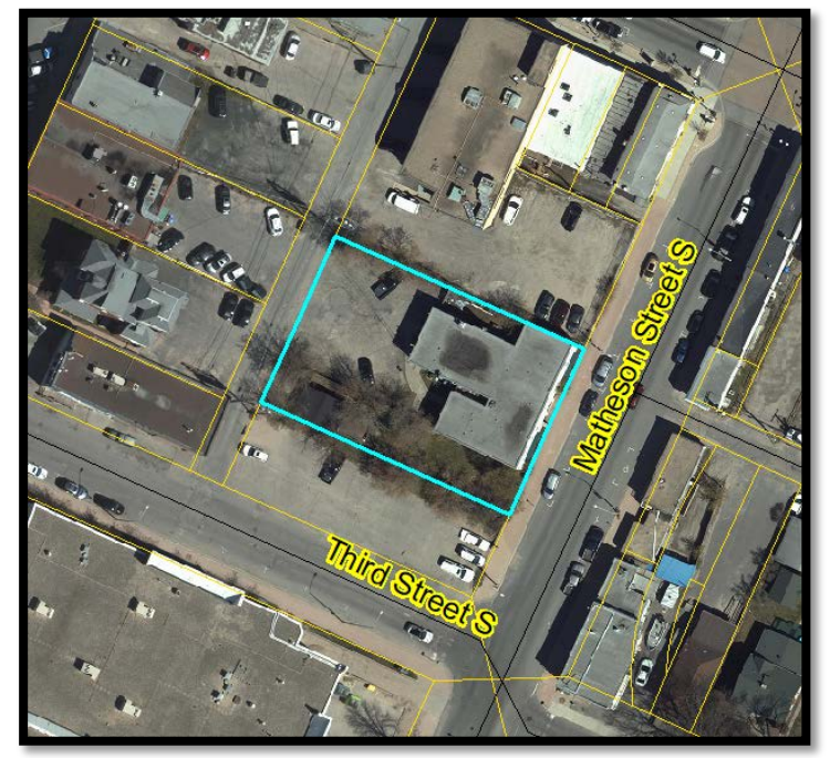
Figure 1: Aerial image indicating the location of the subject property (2019), prior to the demolition of the Northlands building.

An application has been received to change the zoning of the subject property (Figure 1) from "I" Institutional Zone to "GC" General Commercial Zone.