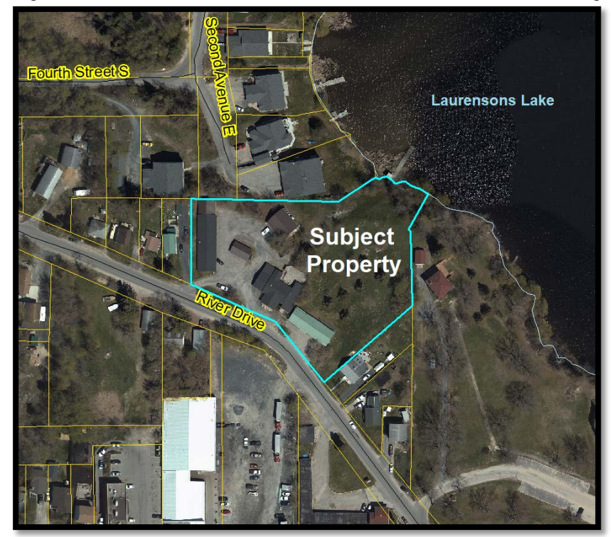
Figure 1: Aerial image indicating the location of the subject property.

An application has been received to change the zoning of the subject property (Figure 1) from "HC" Highway Commercial Zone to "R3" Residential – Third Density Zone.