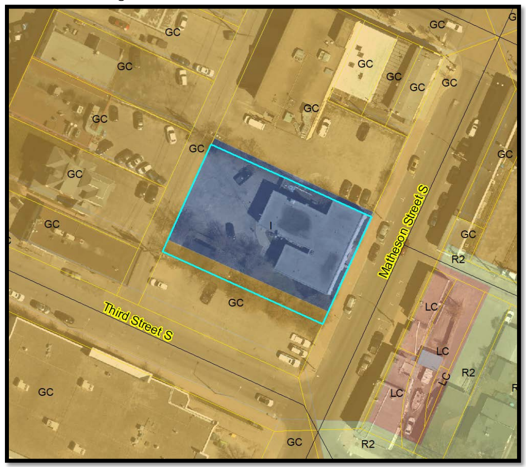
Figure 4 – Existing Zoning By-law Mapping

This application proposes to amend the zoning of the property to "GC" General Commercial Zone. The GC zone allows for a wide range of uses and services to meet the needs of residents, businesses, and tourists. The "GC" zone permits commercial uses only on the ground floor of a building, unless upper storey commercial uses are an extension of the ground floor use. Dwelling units may be located within the same structure and above one or more permitted uses that occupy the first floor of a non-residential use building.