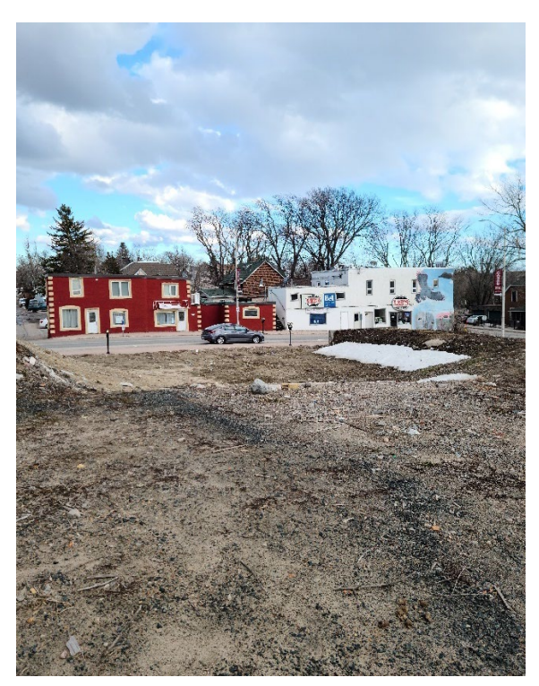
Figure 3 - Existing conditions of the subject property.