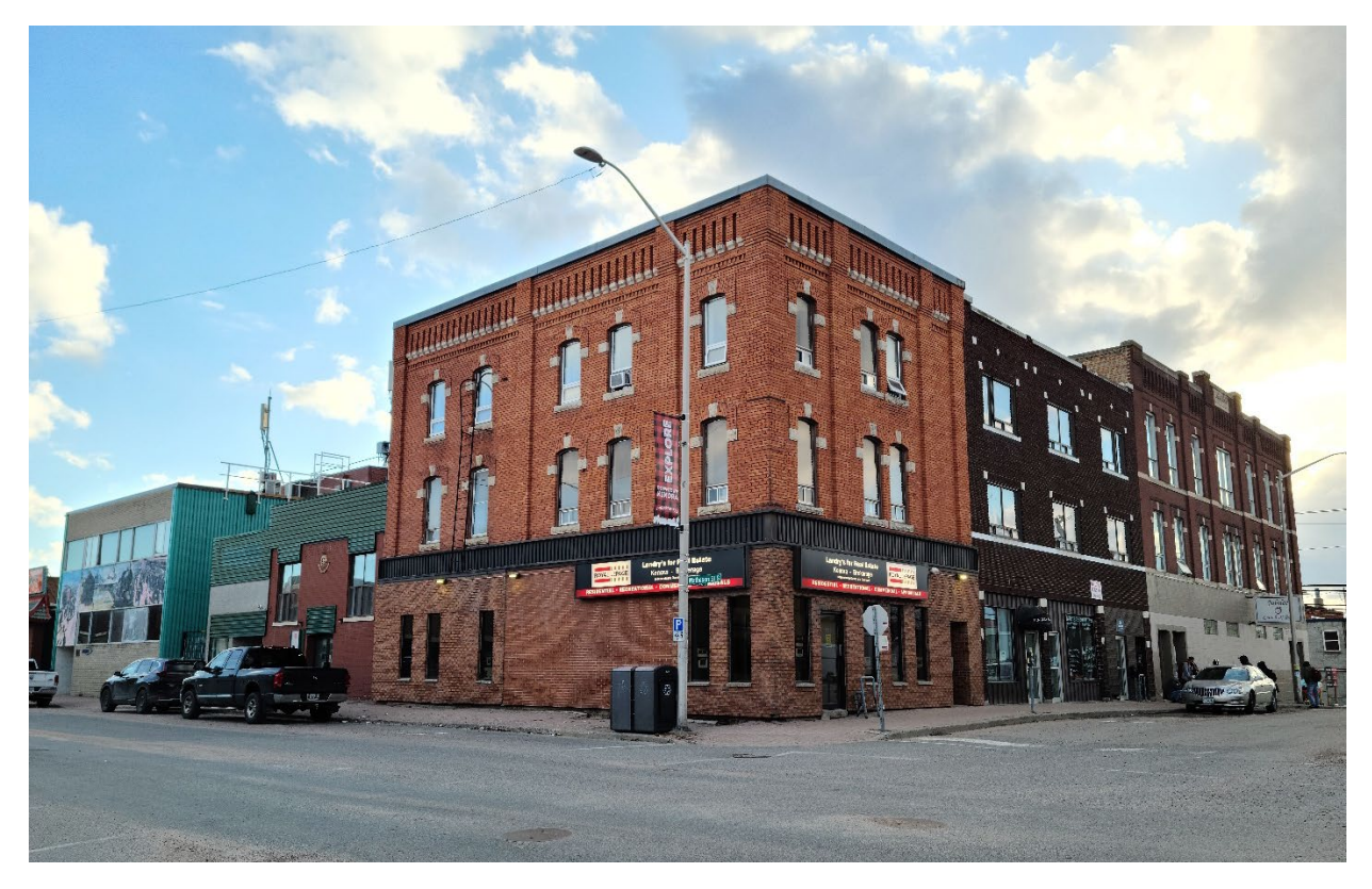
Figure 6 – General Commercial Zoning – Royal Lepage Building on the same Street