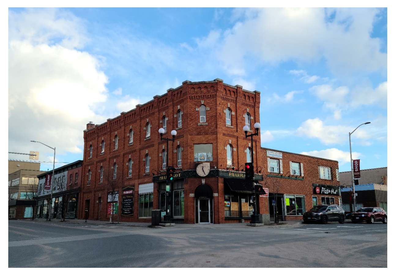
Figure 5 – General Commercial Zoning -Pharmasave Building on the Same City Block

The proposal is to rezone the subject property from Institutional to General Commercial to permit mixeduse development with commercial uses on the ground floor and residential uses above. The applicant is not proposing any development on the subject property at this time. There is a bidding process currently underway for the submission of an Expression of Interest (EOI) by developers to build a mixed-use building with a provision to ensure some of the units developed meet the criteria for affordable housing. The inclusion of affordable housing units will assist the City of Kenora in meeting the demand for a mix and range of housing types. While there is no proposed development for the subject property at this time, the General Commercial zoning has permitted uses such as the Royal Lepage building (to the north of the subject property along Matheson Street S.), the Pharmasave building (on the same city block as the subject property), and the Board Anyone building (to the east along Second St. S) in the Harbourtown Centre area (Figures 5-7).