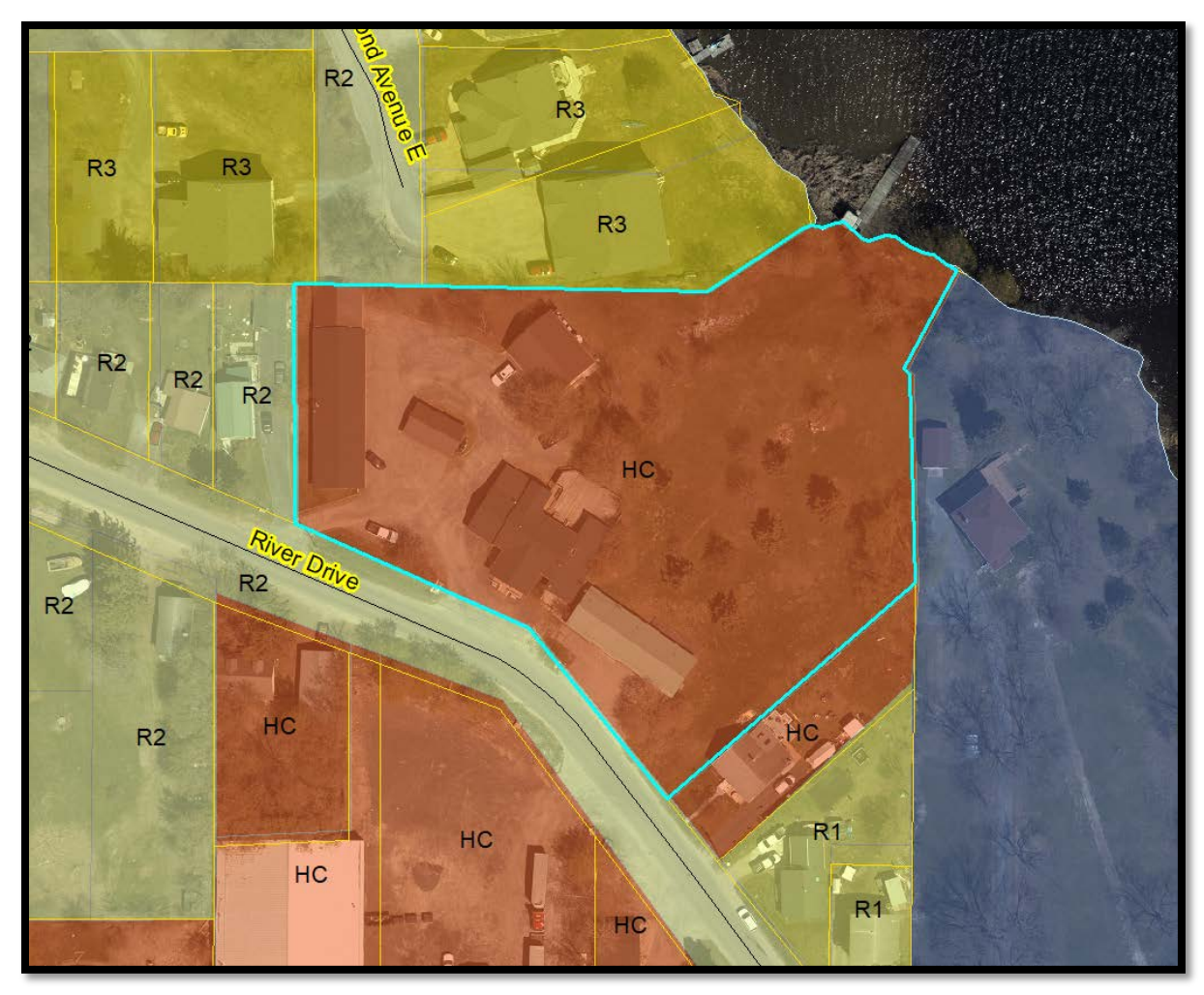
Figure 4 – Existing Zoning By-law Mapping

A Minor Variance (D13-22-05) has been approved by the Planning Advisory Committee, to permit two of the existing structures to be closer to lot lines than is normally permitted when they are converted to multiple-attached dwellings in the proposed R3 zone. As a result of the variance, the required side yard setback of the building in the northwest corner of the property has been reduced from 2.5m to 0.95m and the required front yard setback of the central building has been reduced from 6.0m to 5.4m.