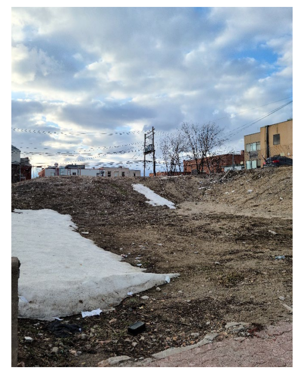
Figure 2 - Existing conditions of the subject property.

The subject property was previously the site of the Northlands Supportive Housing building which has since been demolished. Currently, the site is vacant with a mix of exposed bedrock and clean, machine-packed, fill (Figures 2 and 3). There is a moderate grade change (approximately 3m height difference) from Matheson Street to Hennepen Lane at the rear of the lot. An environmental site assessment (ESA) was prepared for the subject property by Pinchin Ltd. and the ESA report is included with this application package.