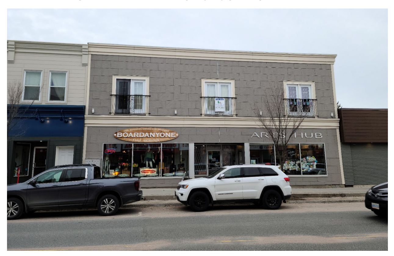
Figure 7 - General Commercial Zoning - Board Anyone Building on Second Street S.