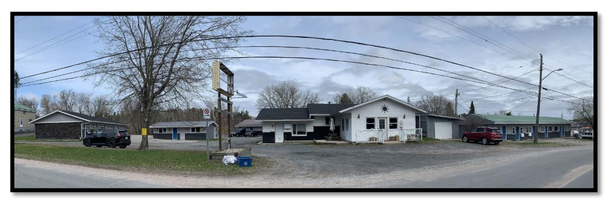
Figure 2 – Photo of the property from River Drive.

On May 12, 2022, I conducted a site visit and took the following photo.